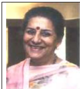
(Smt. Ambika Soni)

Smt. Ambika Soni has been appointed as the new Union Minister of Information & Broadcasting in the present government. Smt. Ambika Soni has been in active politics for long. She was first elected to Rajya Sabha in 1976. Since then she has held various positions in the Govt. She was member of various committee in the past such as Committee on Public Undertakings, Consultative Committee for the Ministry of Civil Aviation, Committee on Defence, House Committee, Committee on Transport, Tourism and Culture, Committee on Home Affairs, Committee on Transport, Tourism and Culture, Consultative Committee for the Ministry of Environment and Forests and Member, Post-Graduate Institute of Medical Education and Research, Chandigarh etc. She was the Union Minister of Tourism and Culture in the last government