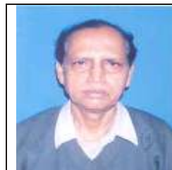
(Shri C. M. Jatua)

Shri Choudhary Mohan Jatua has been appointed as the Union Minister of State of Ministry of Information and Broadcasting. Born at Nagendrapur, 24 Pargana South (West Bengal) on 9 th June 1938, Sh Jatua served as Member, West Bengal Legislative Assembly( 2001-2006) before getting elected to 15th Lok Sabha( 2009). A Post Graduate in commerce from Kolkata university, Shri Choudhury Mohan Jatua has been a civil servant (I.P.S. Officer) and possesses vast administrative experience.. Shri Jatua has special interest for sports and music.