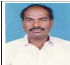
(Dr S Jagathrakshakan)

Dr S Jagathrakshakan has taken over as Ministers of State in the Ministry of Information and Broadcasting. Dr. Jagathrakshakan has been elected from Arakkonam Constituency. He was member of Tamilnadu Legislative Assembly during the period of 1980-1984. He was elected to 8 th and 13 th Lok Sabha also apart from being elected to the present 15th Lok Sabha. He was member, Committee on Official Language (1987-88), Member, Committee on External Affairs (1999-2000), Member, Committee on Human Resource Development, Member, Consultative Committee, Ministry of Heavy Industries and Public Enterprises( 2000-2004) in the past, before being appointed as the Union Minister of State, Information and Broadcasting in the present government.